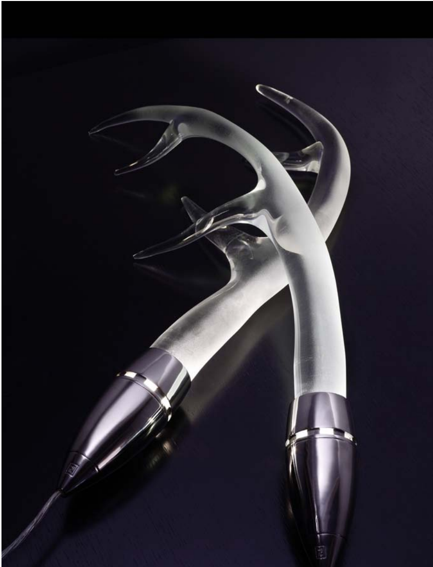
FF Icelite 2 MUR LMP20