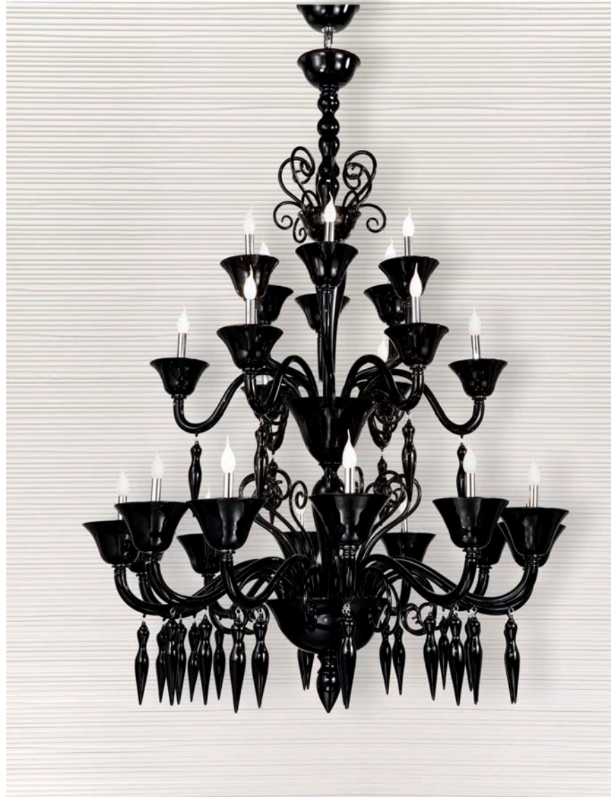
FF Venice Black